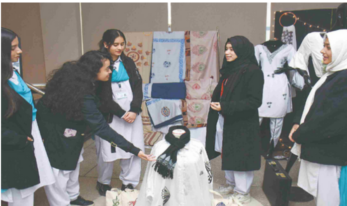
Islamabad: Students showcase their work at the Annual Art and Textile Exhibition held at F.G. Home Economics and Management Sciences College.