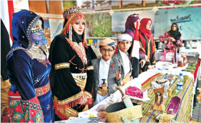
Islamabad: Women attending the PFOWA Annual Charity Bazaar